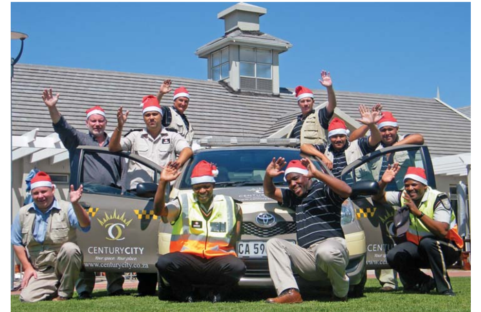
The Century City Security Team getting in the spirit of things

Both Canal Walk and Ratanga Junction will be stepping up their security for the season. SAPS has also included Century City in their Festive Season Plan and will have foot patrols in Canal Walk and its parking areas, mounted horse patrols and random morphed touch operations aimed at increasing their visibility and policing in the area.