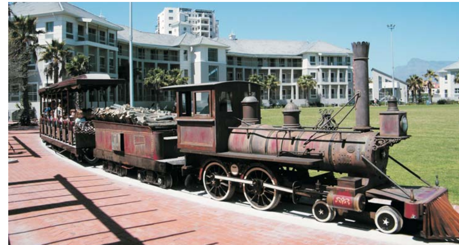
The Temperance Flyer from Ratanga Junction will be offering rides to at Central Park at the Century City Carols By Candlelight on December 13.