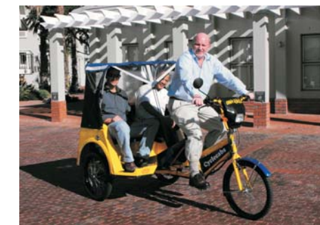
Empowerment Network, Rikkis, Men on the Side of the Road and St Patrick's Trust.

Cyclecabs also has an important job creation aspect. Partners in the Cyclecabs business are Bicycling