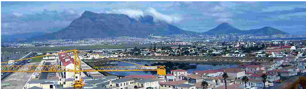
The view which can be enjoyed by some of the higher Villa Italia apartments

Demand for housing at Century View, which is also home to Villa Italia, continues unabated with buyers snapping up the entire 60-unit first phase of a new upmarket, single residential erven project, The Avenues in the first week of its launch.