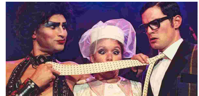
Riff Raff with the hapless Brad and Janet

Local audiences are encouraged to don their finest Rocky get-ups to become part of the action in this hit show, which celebrates its 30 th anniversary this year.