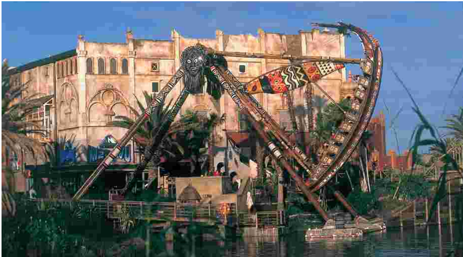
The ever favourite Congo Queen swinging into action at Ratanga Junction