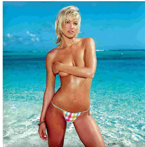
SA Sports Illustrated Swimwear Issue will be showcased at Century City's 4th Birthday celebration in a fashion spectacular.

Wines that received various awards will be available for the first time as well a number of new wines will be released at the wine festival. Visitors will have the opportunity to meet the winemakers to discuss their products. The entry fee includes an international wine tasting glass and a programme with detailed descriptions of all the products.