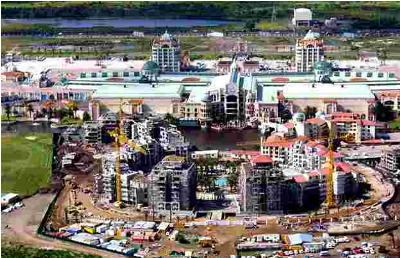
The Island Club under construction on the North Bank, opposite Canal Walk

Ground-breaking technology paving the way to a cashless community is being installed at The Island Club residential development where the first handovers have been taking place.