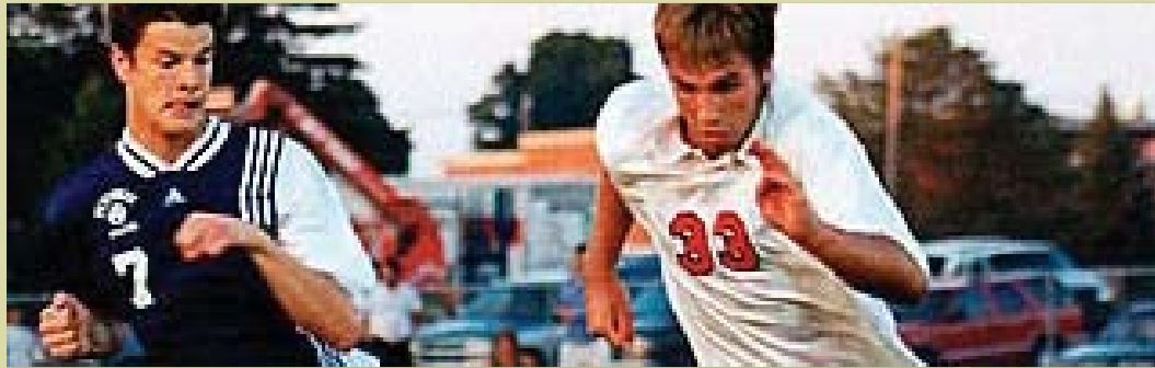
PAGE: 3 - 4 - CENTURY CITY TO STAGE SPORTS FESTIVAL