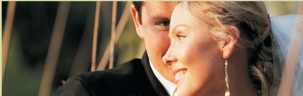
PAGE: 5 - 7 - WHAT'S ON AT CENTURY CITY