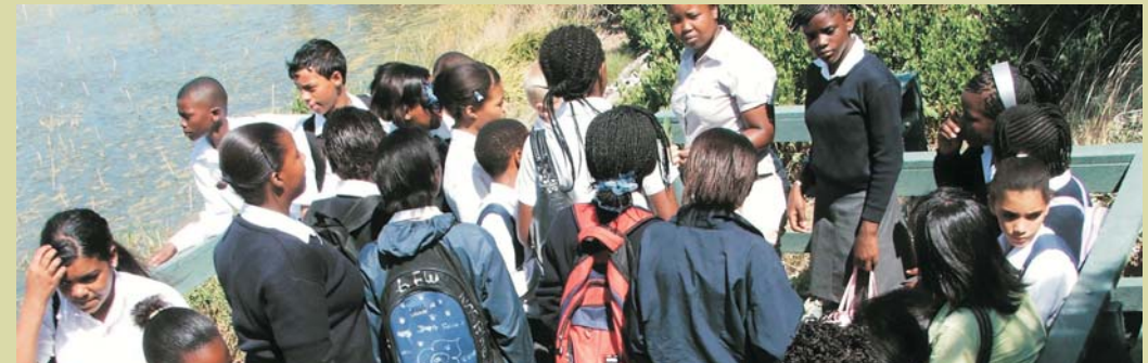
PAGE: 8 - 9 - CENTURY CITY PROPERTY OWNERS' ASSOCIATION (CCPOA) NEWS