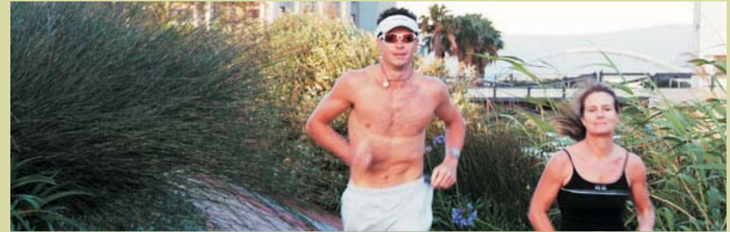
PAGE: 4 - CENTURY CITY EVENTS