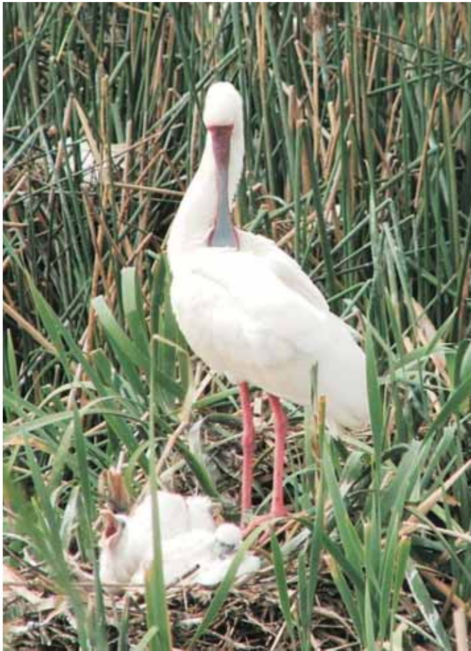
A Spoonbill with her chicks

The annual breeding season started early this year with record numbers of Spoonbills being recorded.