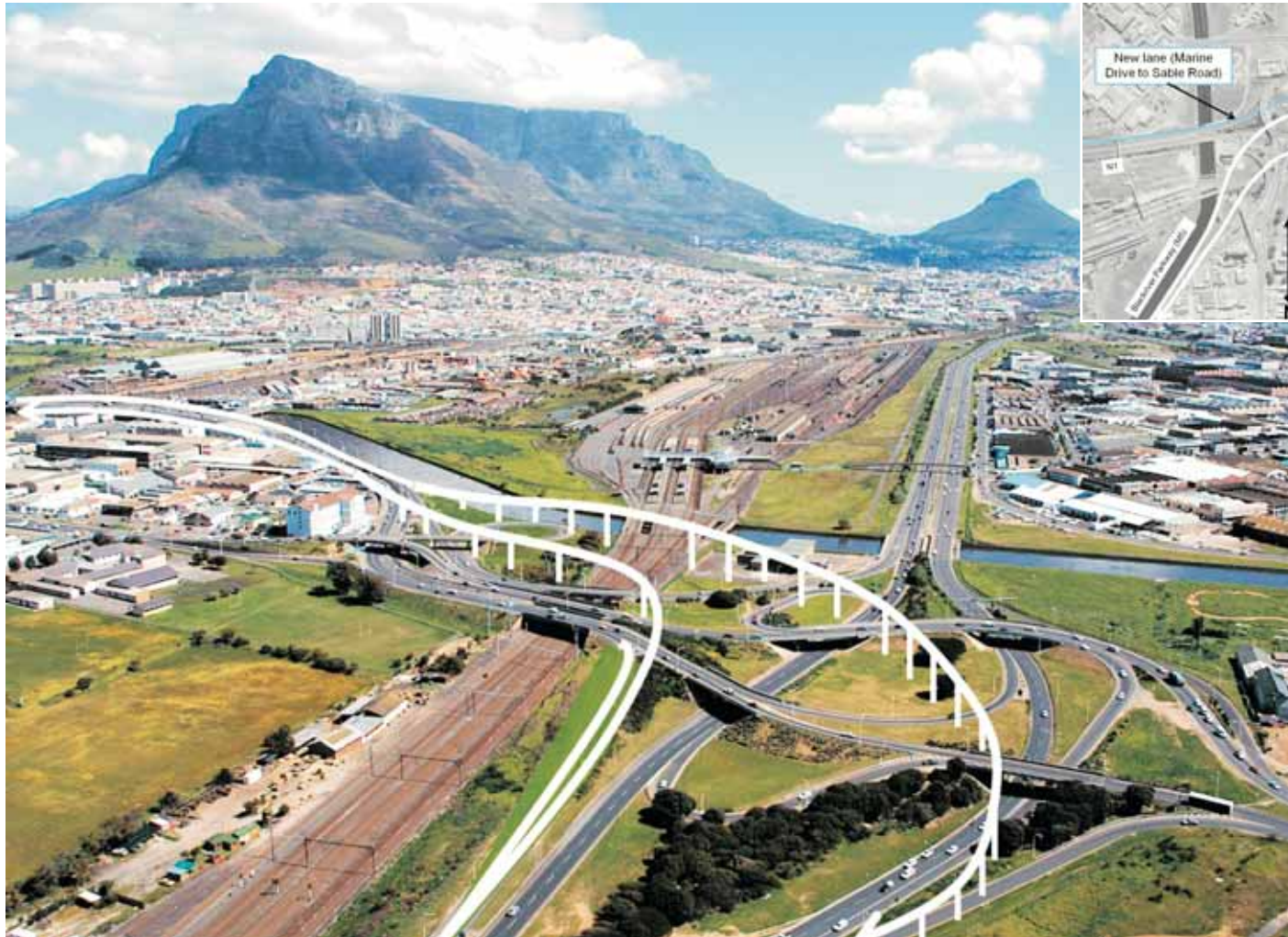
New directional ramps to be constructed as part of the Koeberg Interchange upgrade