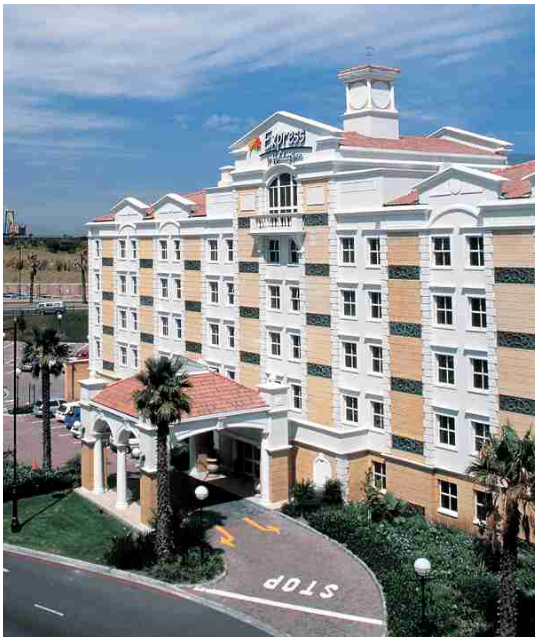
The Express By Holiday Inn at Century City

He said the hotel had an equal share of the corporate and leisure markets and was proving particularly popular with Mauritian tourists who were coming to South Africa on shopping holidays and spending their money in Canal Walk.