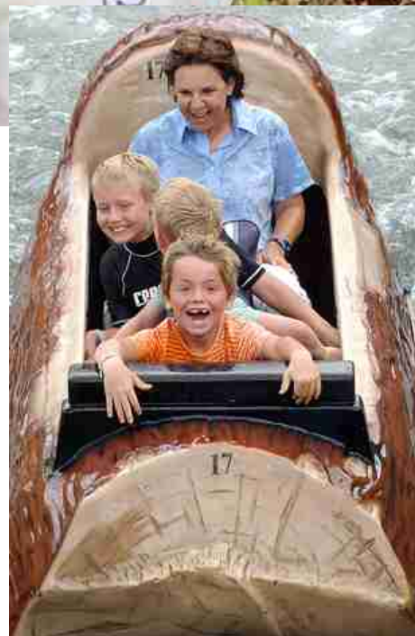
Some of the more than 10 000 disadvantaged adults and children who were treated to a day at Ratanga Junction by the theme park.

Full rider tickets remain unchanged at R90.00. Junior rider tickets for those shorter than 1,3m are R45.